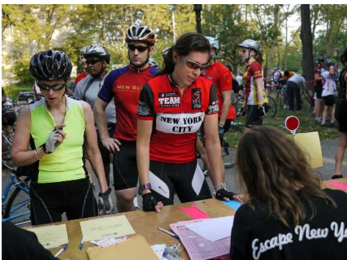
Escape New York, 2010